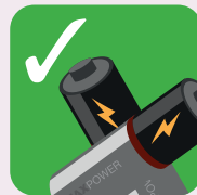
Batteries in a separate bag