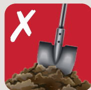
Soil and stones

Remember – You could compost your garden waste at home. To find out more about composting, visit molevalley.gov.uk