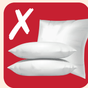
Pillows and duvets

Remember – Items must be clean, dry and in no more than one small, tied carrier bag placed next to your bin.