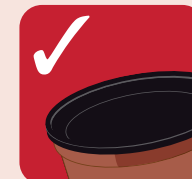
Plant pots and hard plastic