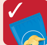
Crisp packets and wrappers