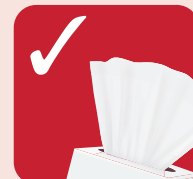
Tissues and wipes