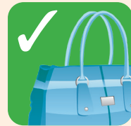
Bags and belts