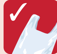
Plastic bags and cellophane