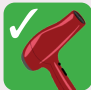
Anything with a plug