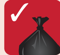
Black bin bags