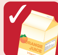
Food and drink cartons